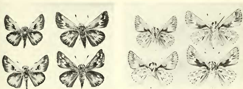
Fig. 1. Dorsal and ventral surfaces of summer specimens of Polites sabuleti sabuleti from the Central Valley of California.